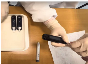
Fig.2: cPG measurement session