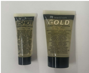
Fig.1: Glucose-Saccharose-Fructose jelly 15[g] and 40[g]