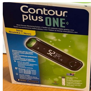
Fig. 3: Contour Plus One glucometer

The glucometer used was the Contour Plus One (Fig.3), due to its high precision and accuracy as per previous related studies.